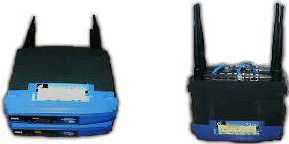
Fig. 2. UCSB Wireless Testbed Device.

in-band. In-band operation has two disadvantages: (1) the delivery of monitoring information is overhead and can therefore lead to an inaccurate assessment of network performance; and more importantly, (2) an outage in the network can result in the failure of the delivery of monitoring information required to analyze and troubleshoot the outage itself.